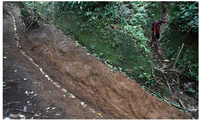
Fig. 1. Soil sedimentation by trail motor.

Another problem is the increasingly widespread hunting of wildlife, forest fires and damage to nature reserves due to geothermal exploration activities. The damage to the area is exacerbated by the existence of trail bike activities. As an ex-situ security measure, operations and patrols are carried out by the Kamojang Resort and joint patrols with Brimob task forces, forest rangers, TNI and environmental activists. The following figure is the condition of the soil in the nature reserve that is experiencing sedimentation due to the trail motor.